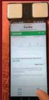
ECG Reading Using Kardia Mobile