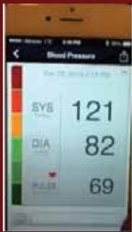
Blood Pressure Vitals Capture