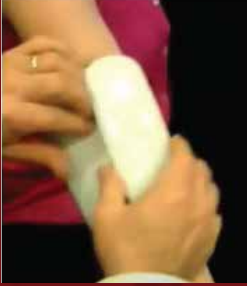
Blood Pressure Device

Telemedicine and homecare solutions allows patient records to be captured seamlessly from medical devices and transferred instantly to the doctor in a hospital or clinic to give a Tele/video consultation to the patient. We have integrated our Telemedicine solution with medical devices – Oximeter, Thermometer, Blood Pressure device and ECG device.