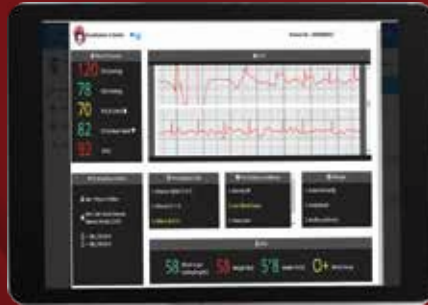
Dashboard Displaying Patient Vitals