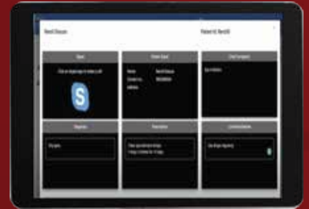
Dashboard with Skype For Tele / Video Consultation