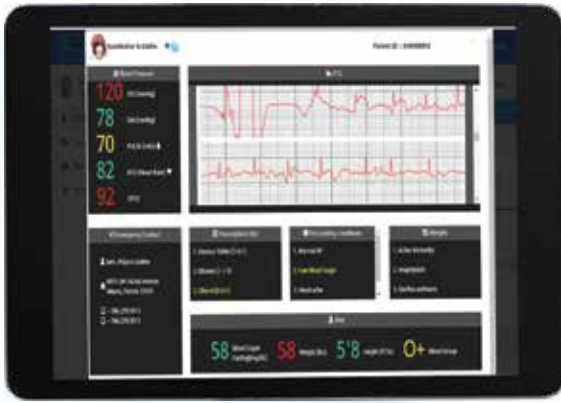
Dashboard with patient vitals